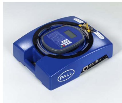
PFC400W Particle Counter

The PFC400W counter is very easy to operate and can either be permanently installed on-line to monitor critical applications (e.g. component test facilities) or used as a portable device for routine condition monitoring of various hydraulic, lubrication, and other fluid systems.